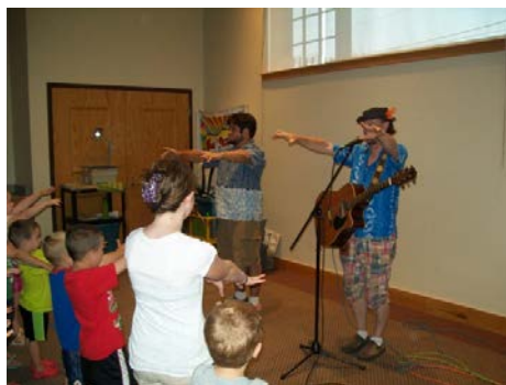
Toe Jam Puppet Band