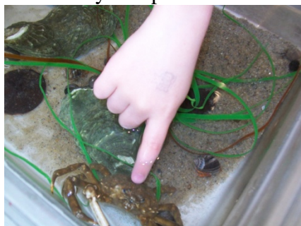
New England Aquarium Tidepool Crab and Snail