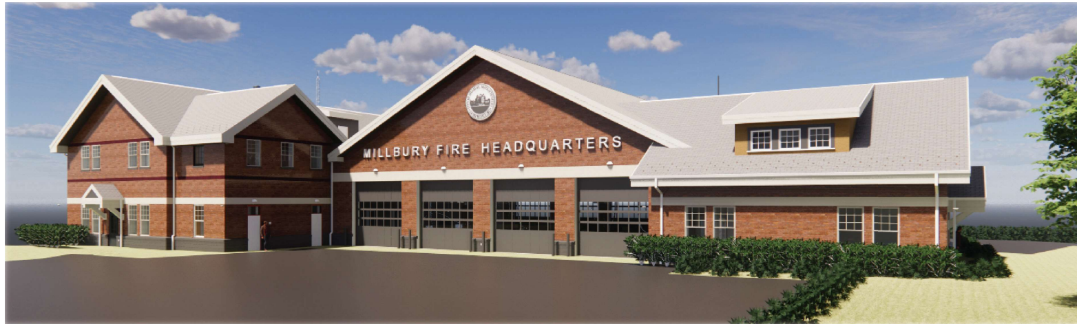
VIEW FROM SOUTHEAST