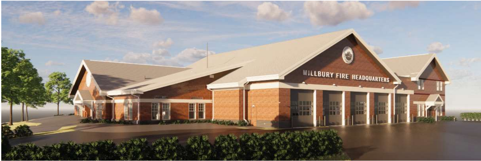
VIEW FROM NORTHEAST