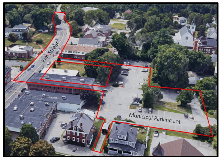
Highlighted Project Area