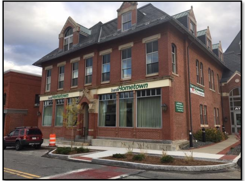
Bumpouts in Phase 1 helped improve environmental conditions and the aesthetics of Millbury Center