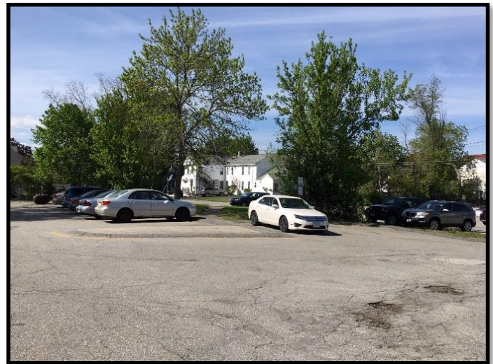
Deteriorating Conditions at Municipal Parking Lot