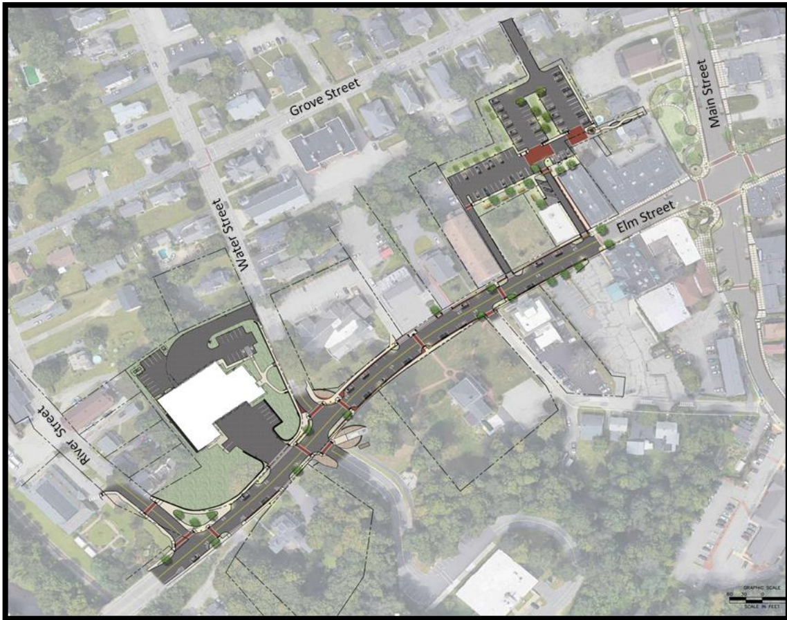
Preliminary Plan Design

Phase II builds off the success, vision and aesthetic of the recent downtown improvements by extending the project benefits to the municipal parking lot and along the Elm Street right-of-way.