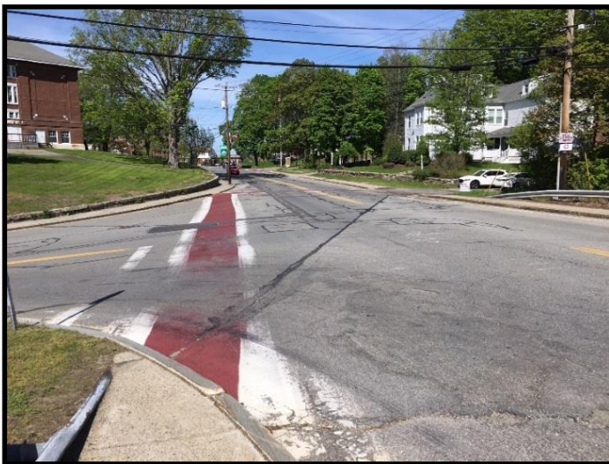
Crosswalk at River St and Elm St